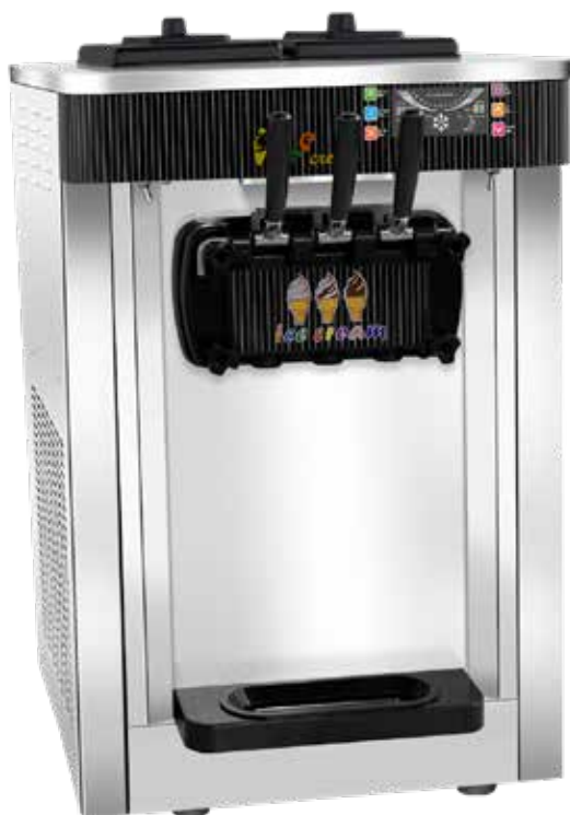
○ JM-S20AB ○ JM-S28AB

JM-S28AB Table top machine Mix Hopper:4.3L*2 Cylinder:1.8L*2