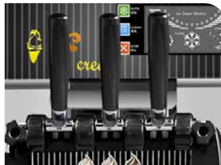
STAINLESS STEEL HANDLE